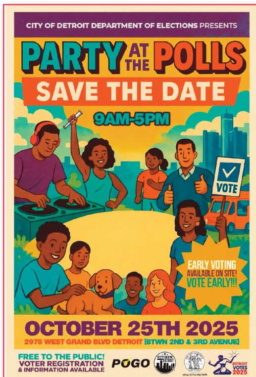
(DABO DETROIT is partnering with the Detroit City Clerk's Office to boost voter participation)