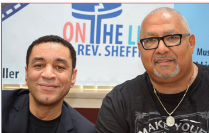
(Wake Up Call Guest Harry Lennix)