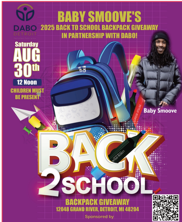
DABO Detroit & Baby Smoove's 2025 Backpack Giveaway