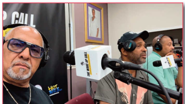
(Wake Up Call Guest Mike Epps)