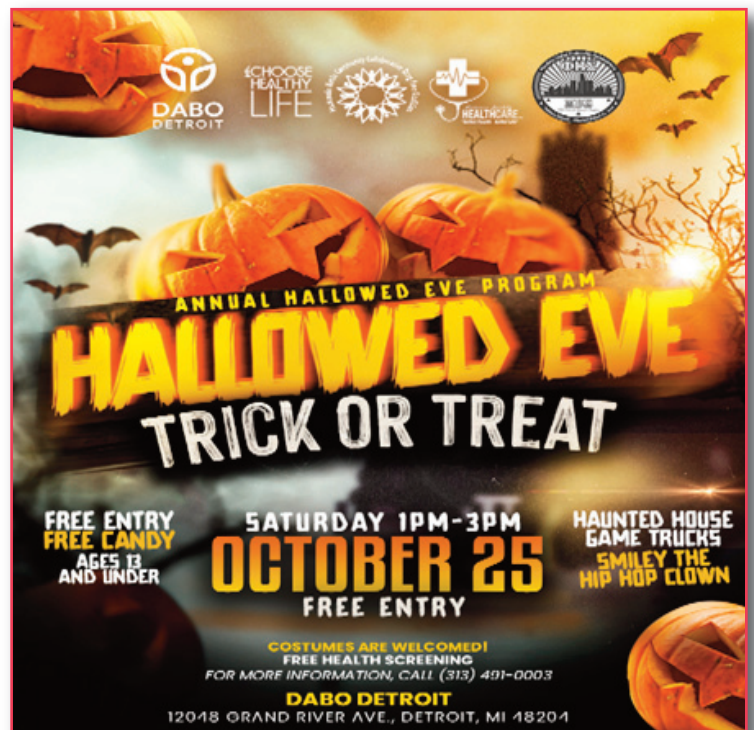
(Our Annual Hallowed Eve is Saturday October 25th, 1:00 pm)