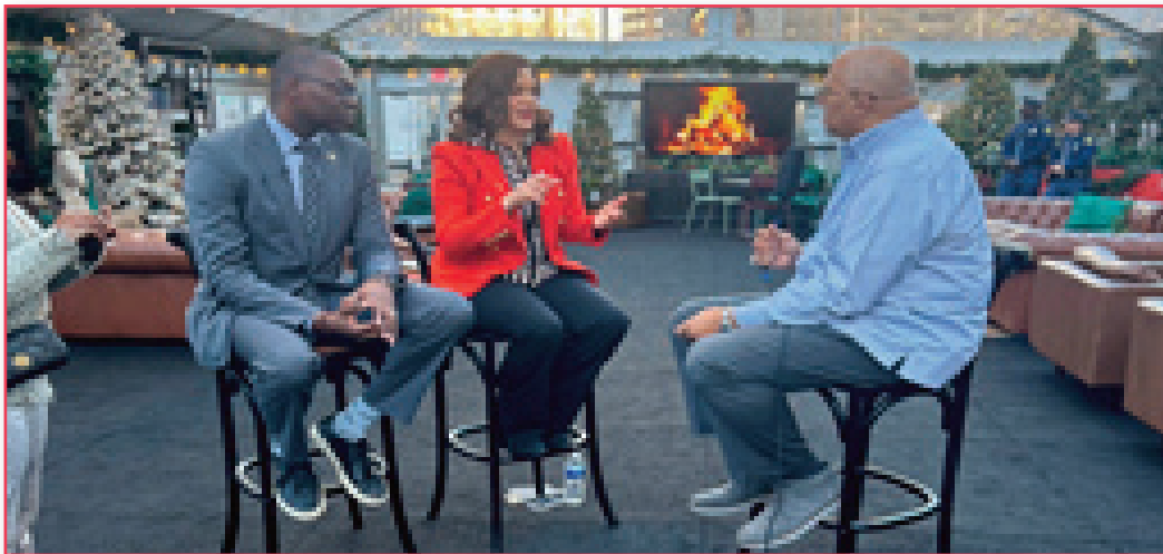
(Wake Up Call Guest Lt. Governor Gilchrist and Governor Whitmer)