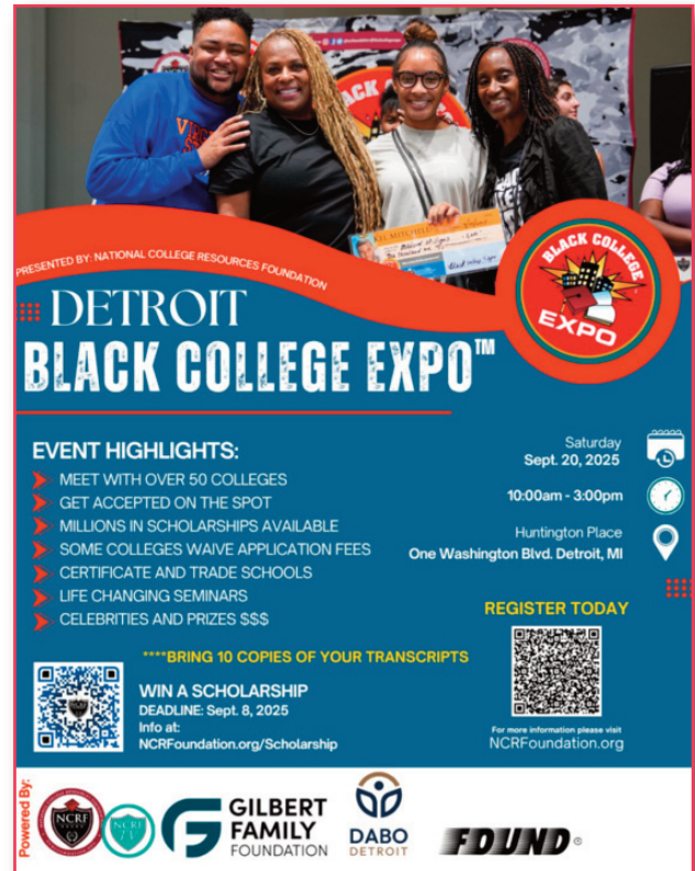
DABO Detroit Supported the Detroit College Expo